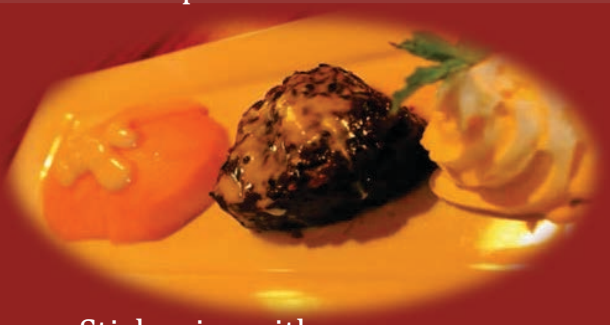
Sticky rice with mango